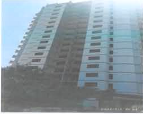
Tower - AD