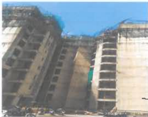
AF & PINNACLE