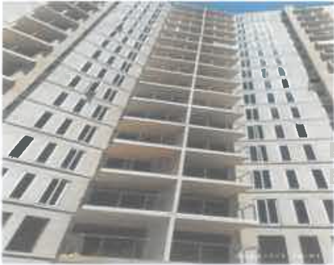
Tower - Y