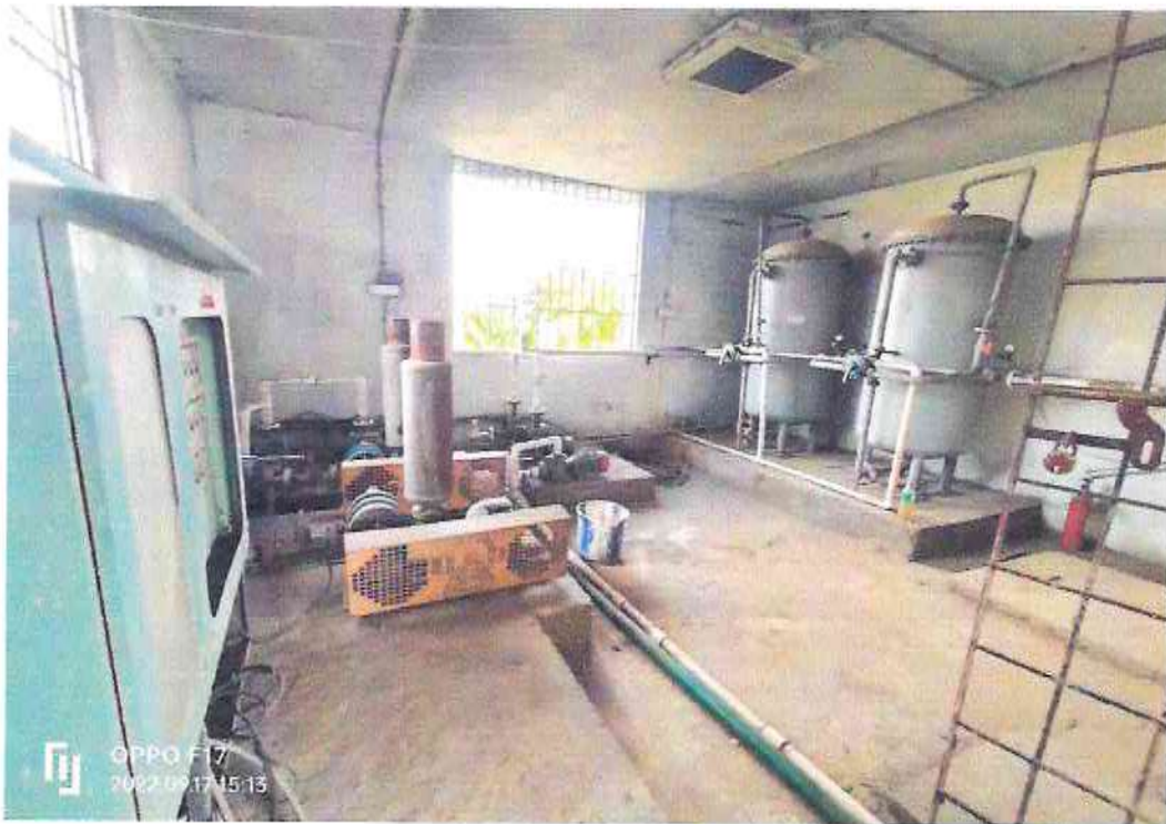
10. STP Room.