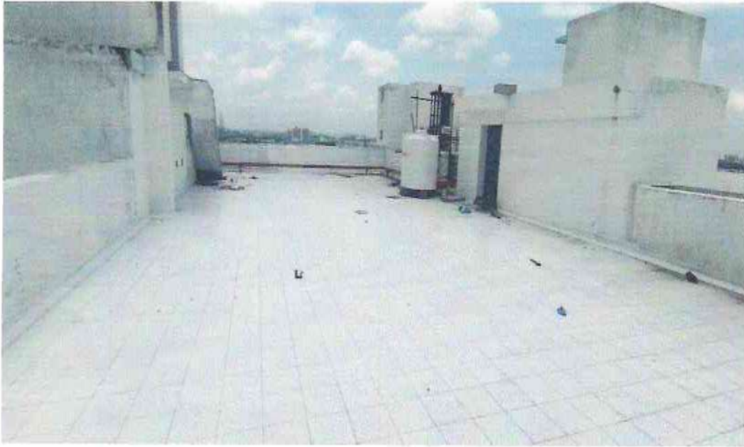
9. Terrace Weather Proofing Completion.