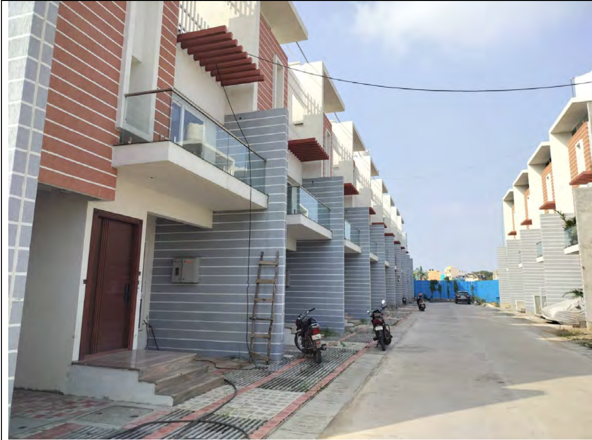
Row House 7 – Finishing work Under Progress