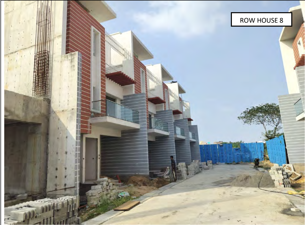
ROW HOUSE 8