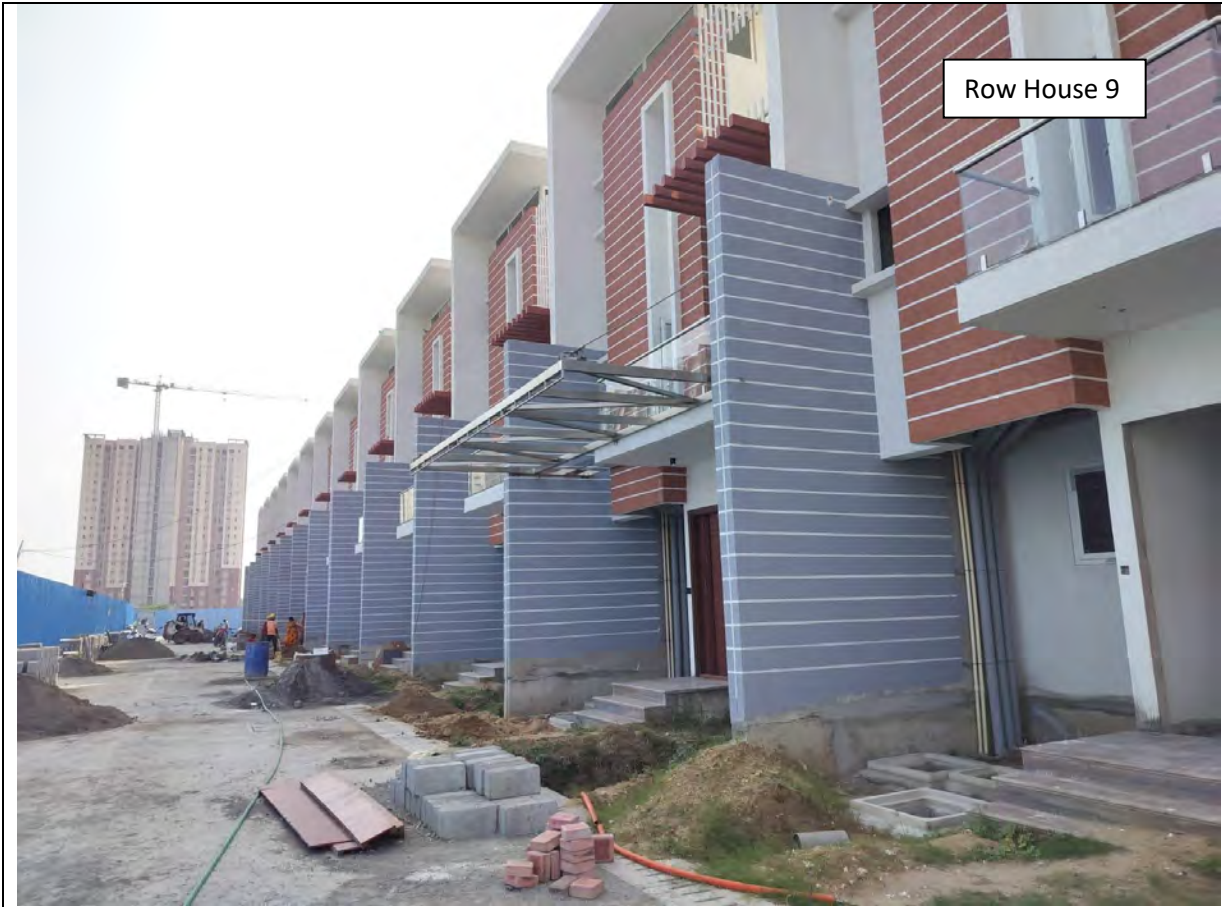
Row House 9