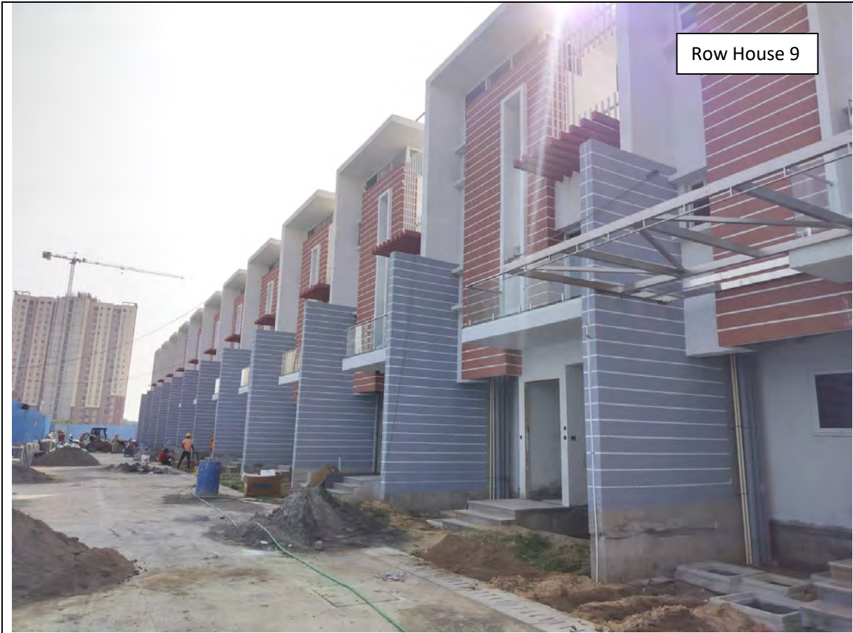
Row House 9