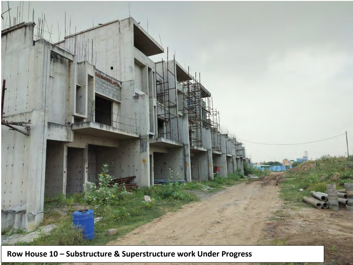
Row House 10 – Substructure & Superstructure work Under Progress