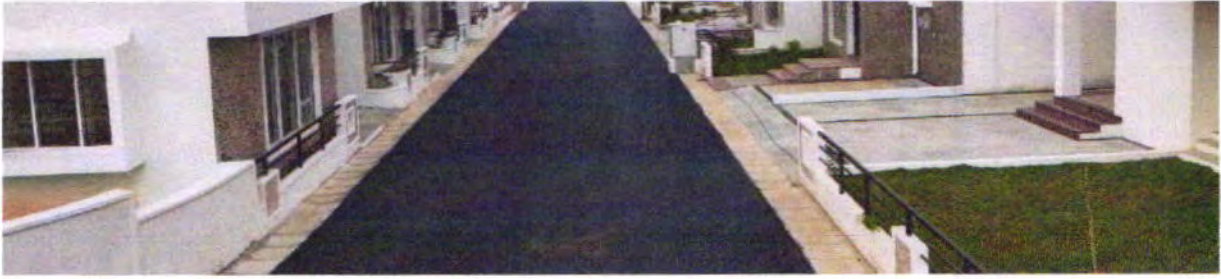
BT COMPLETED IN INTERNAL ROAD