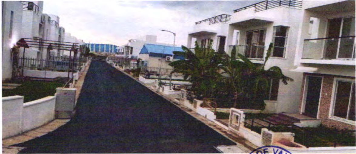
BT COMPLETED IN INTERNAL ROAD