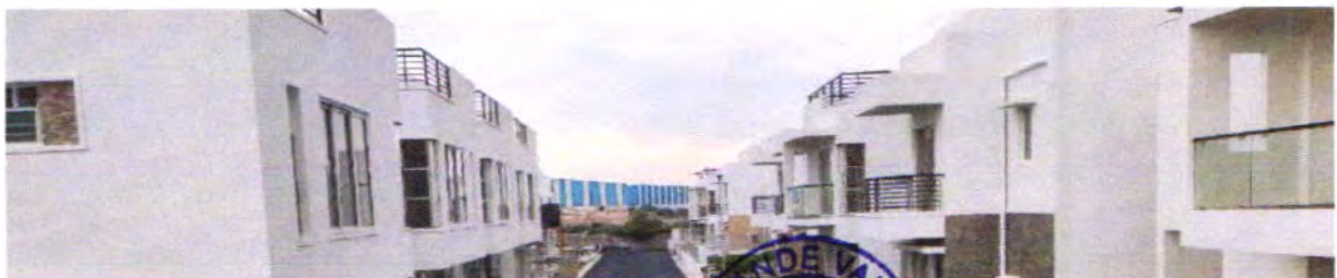
Peripheral Majestic Fencing & Compound Wall Work