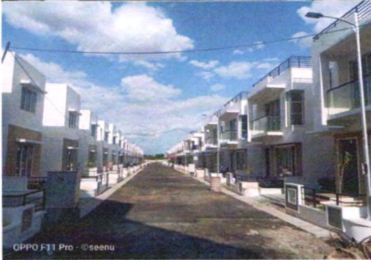
OPPO F11 Pro · @seenu