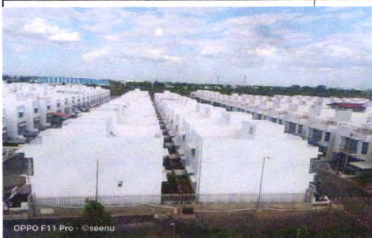
OPPO F11 Pro · @seenu