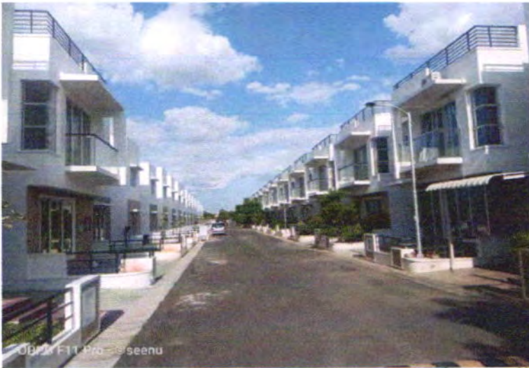
OPPO F11 Pro