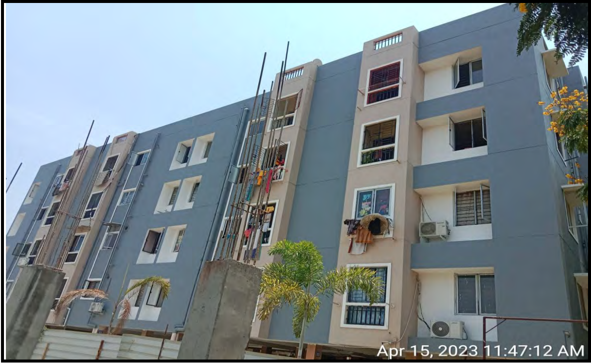
West side Elevation